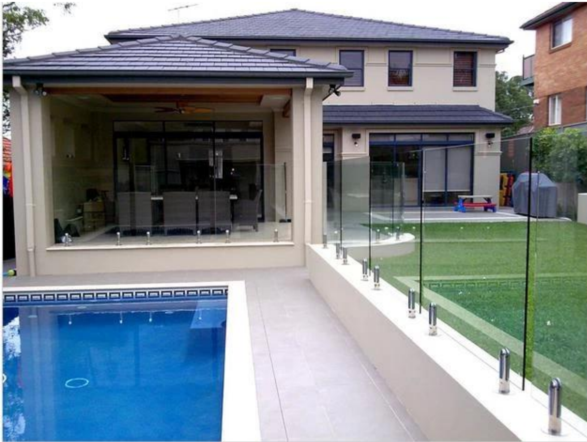
3. 4 types swimming pool fence mounting bracket glass mini posts inox spigot photos,