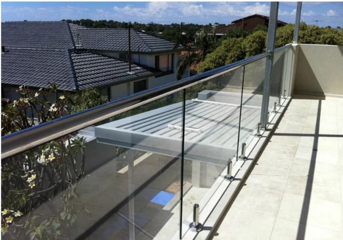
2. stainless steel spigot for swimming pool design: