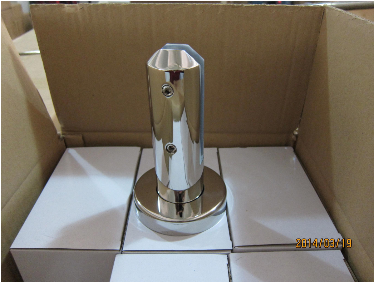
4 types spigot□