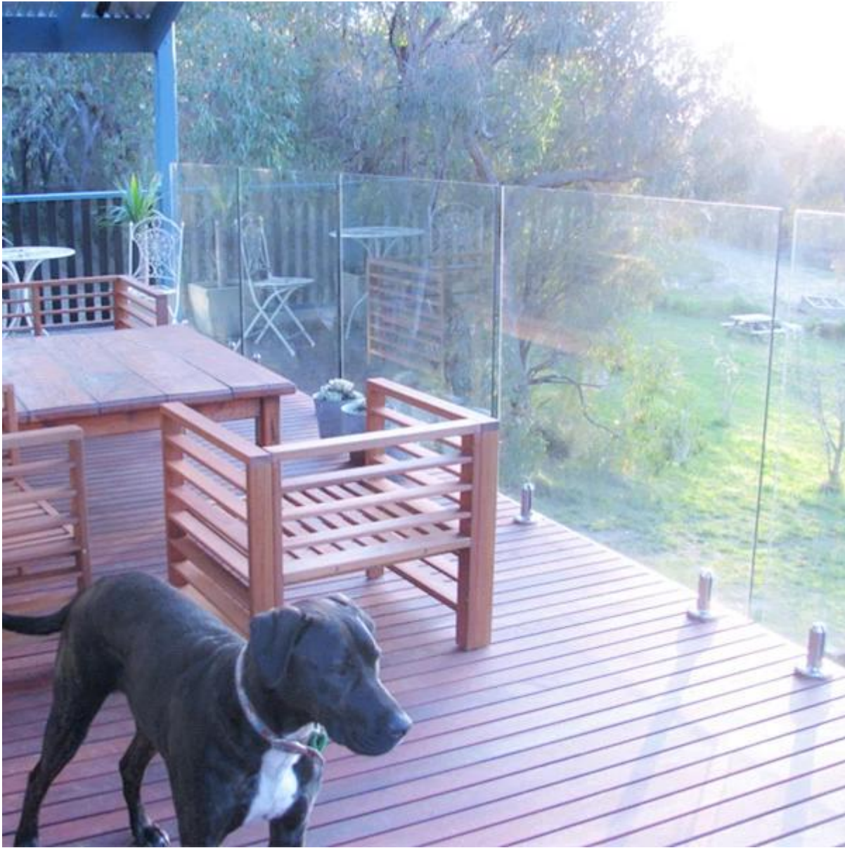
Frameless glass balcony with standoff bracket :