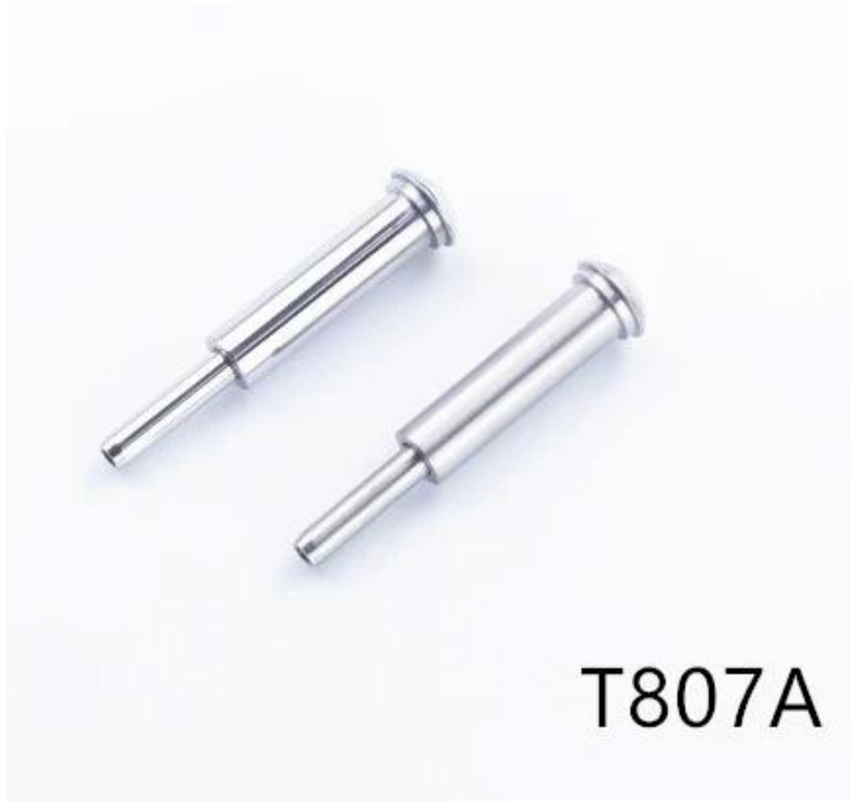
Fotos do projeto de trilhos de cabos com tensionadores de cabo -