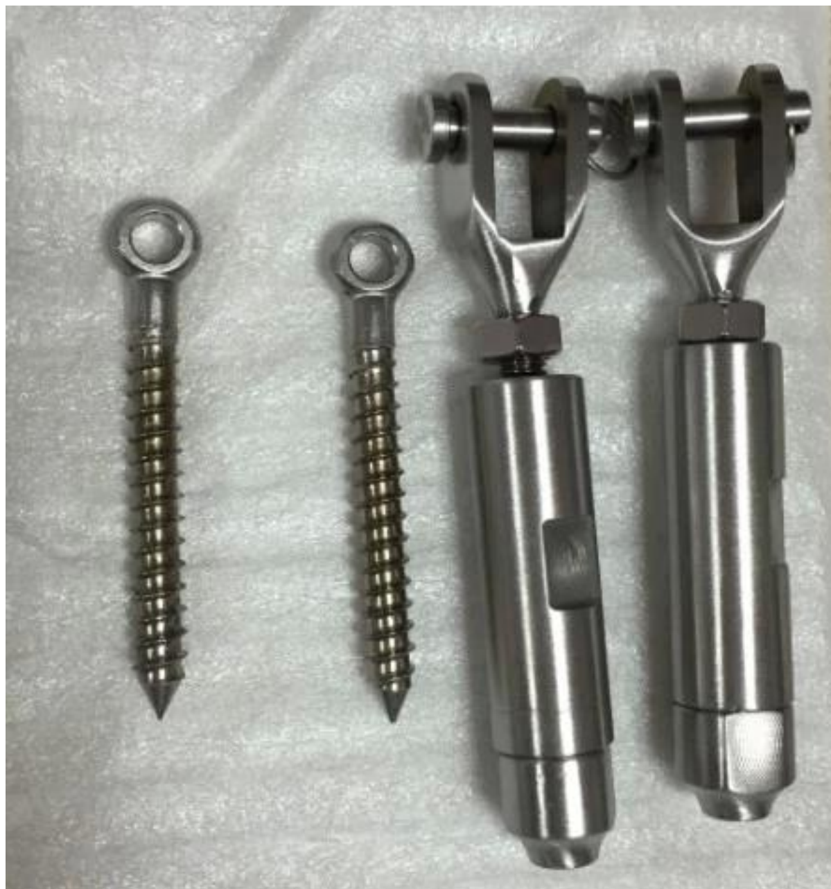
Especificações de desenho do tensionador de cabo T803.