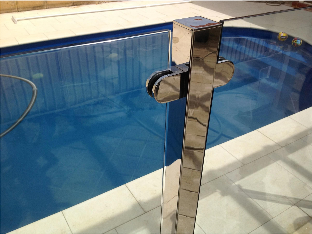
Standoff grade de vidro