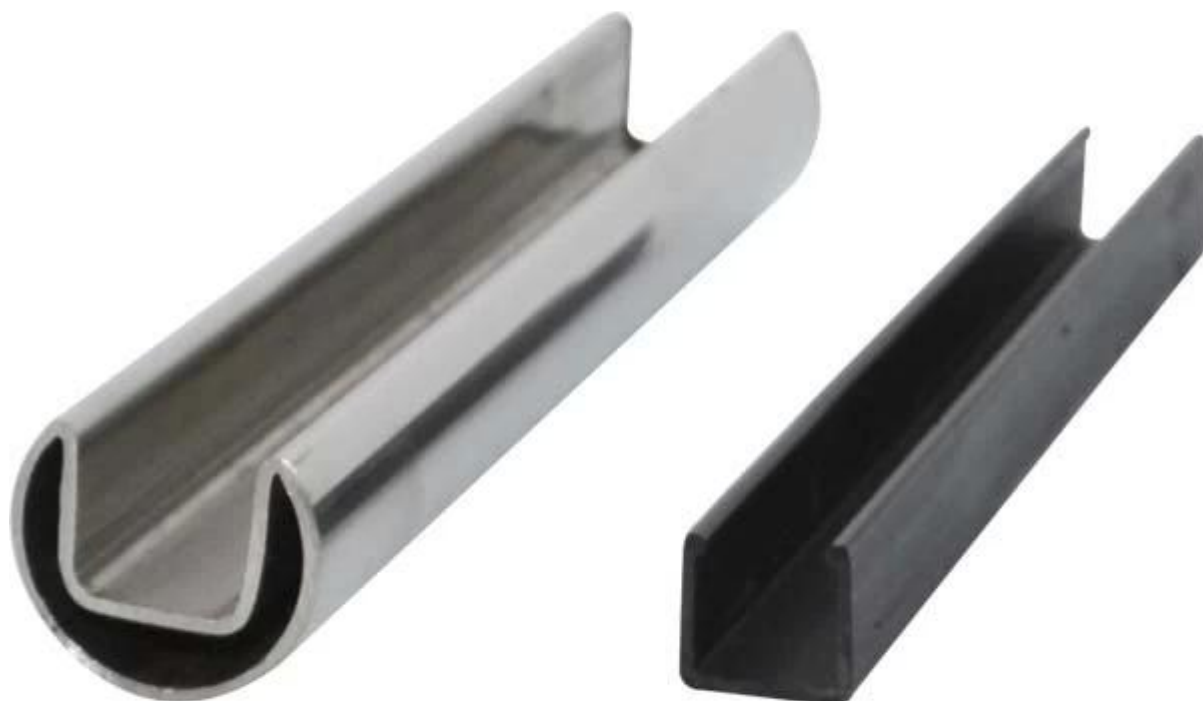
Electro chapeamento na cor ouro e preto Corrimão de aço inoxidável redondo Mini 25mm (5.8M)