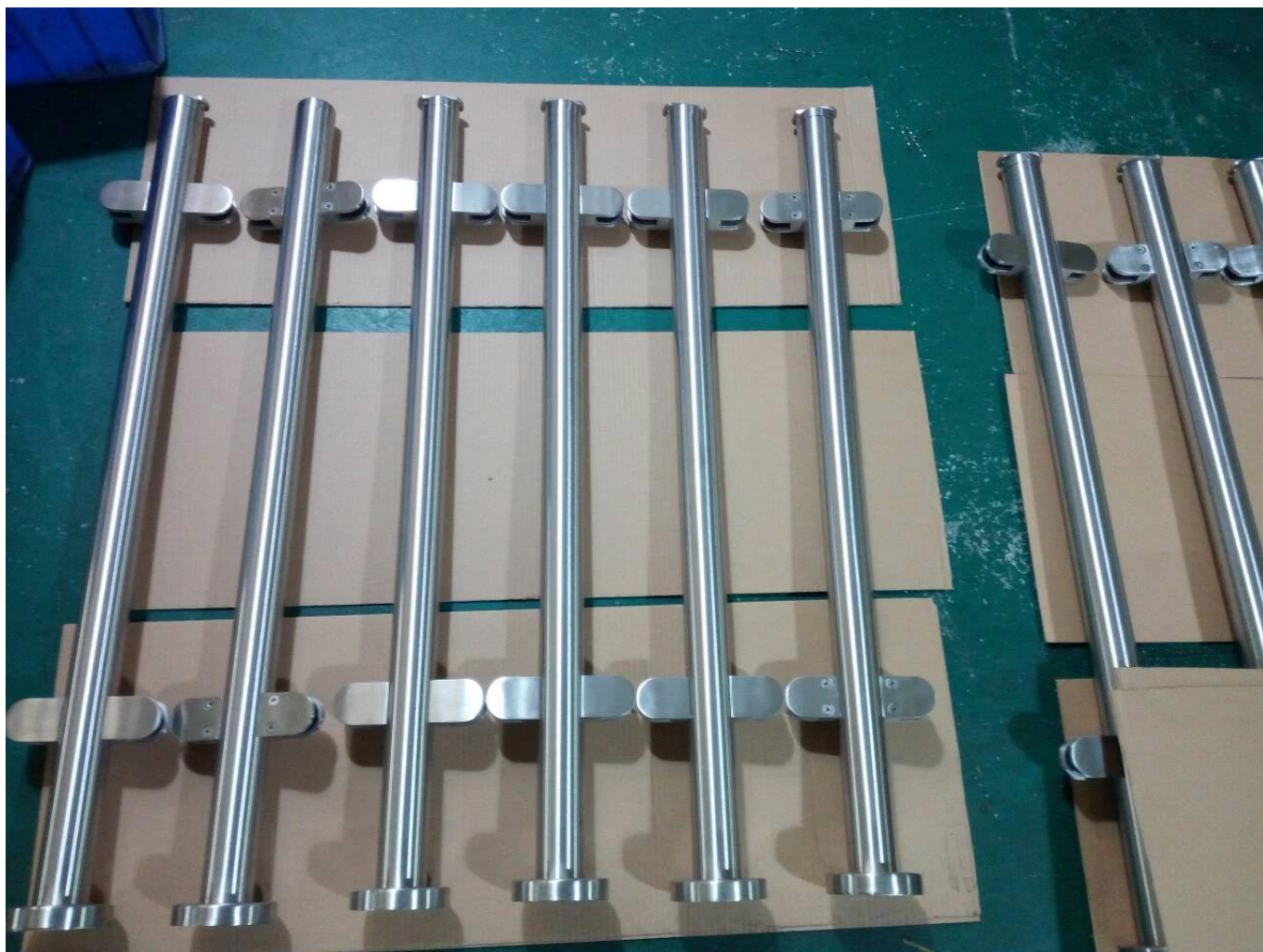
poste de gradeamento de vidro quadrado