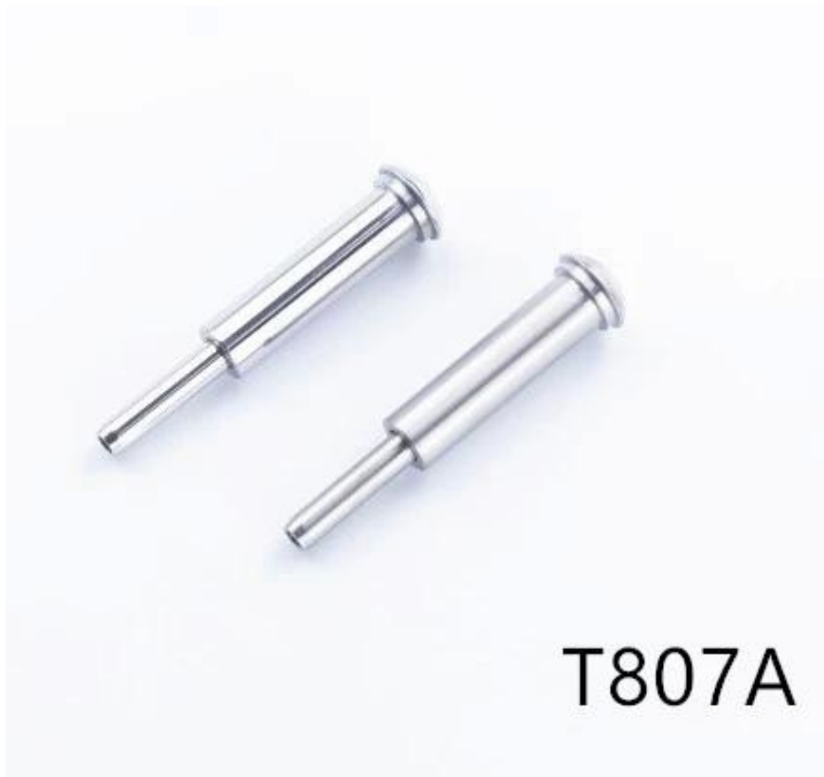
Фотографии проекта кабельных перил с кабельными натяжителями -