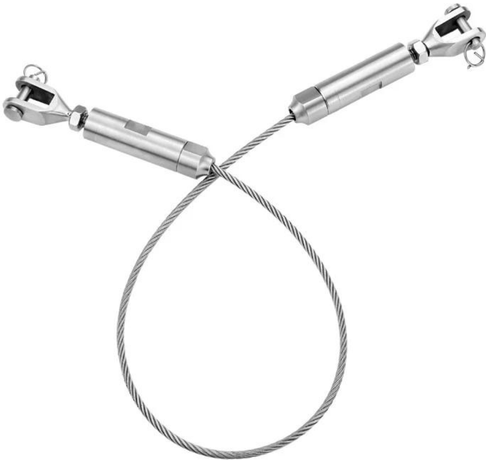
Натяжитель троса T803 с болтом / шурупом