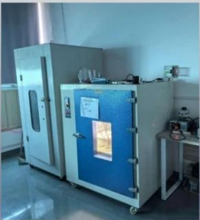
. Aging Test device