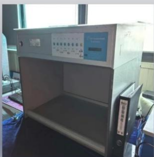
. Color difference light box