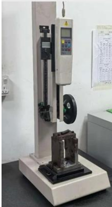
.Tensile Testing Machine