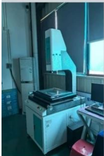
. Optical Projector