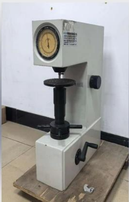
. Hardness Testing Machine