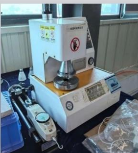
.Carton Abrasion Tester