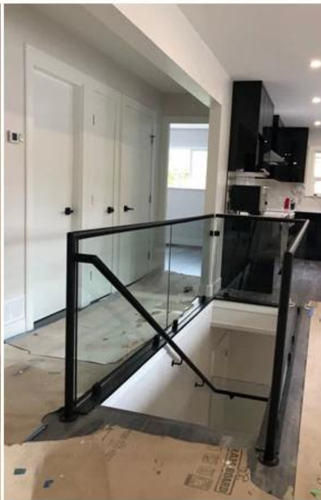
Фотографии проекта стеклянной стойки