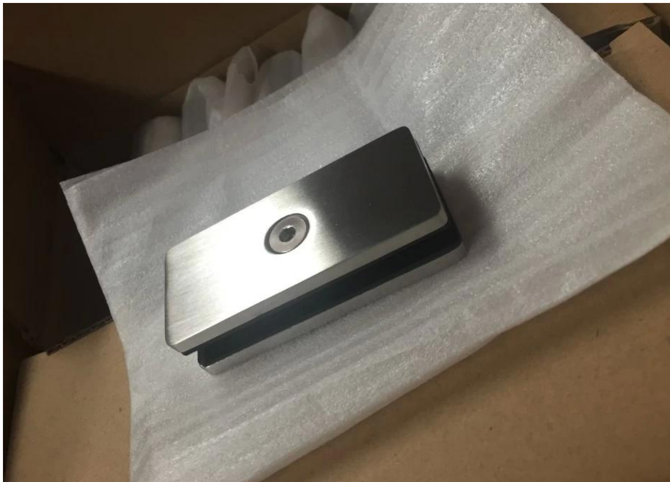
Фотографии проекта для стеклянного зажима на 180 градусов