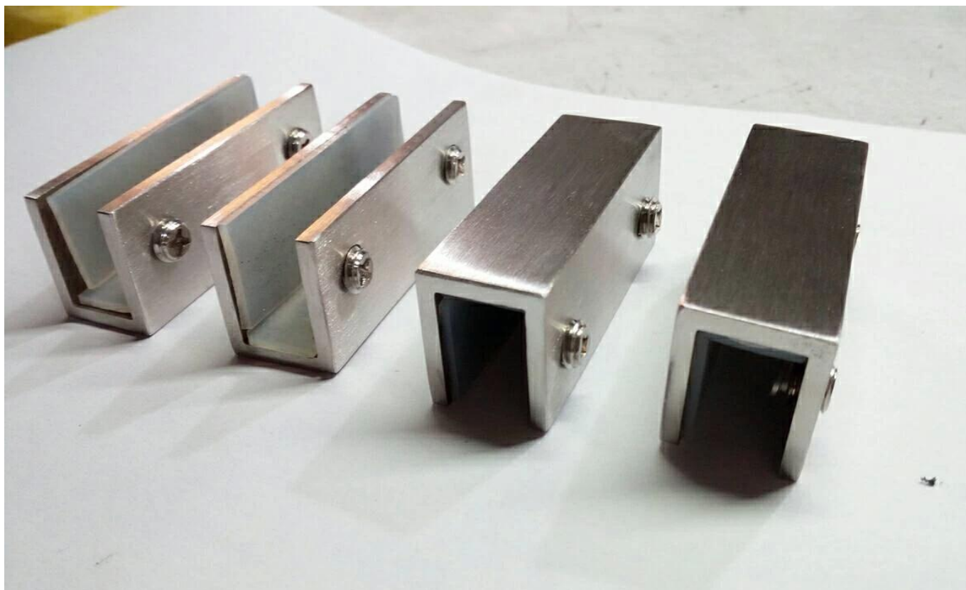
вид сверху для стеклянного зажима на 180 градусов